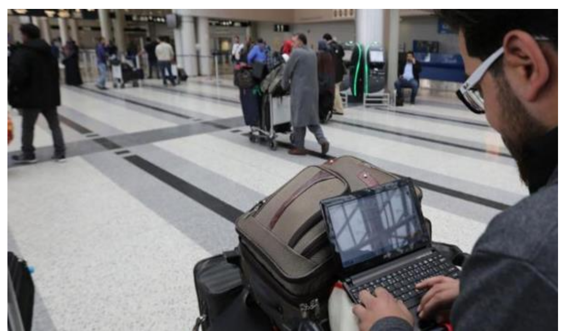
Work is a state of being – not a place