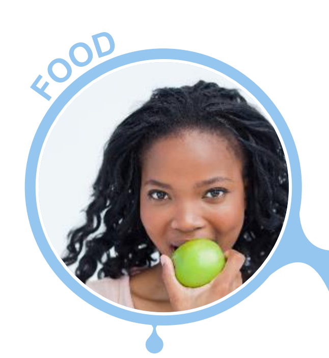
Safety, Quality & Availability Protecting your products with our processing & packaging solutions

The pillars of our brand and the chapters of our sustainability story